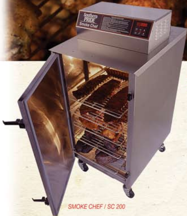
SMOKE CHEF / SC 200