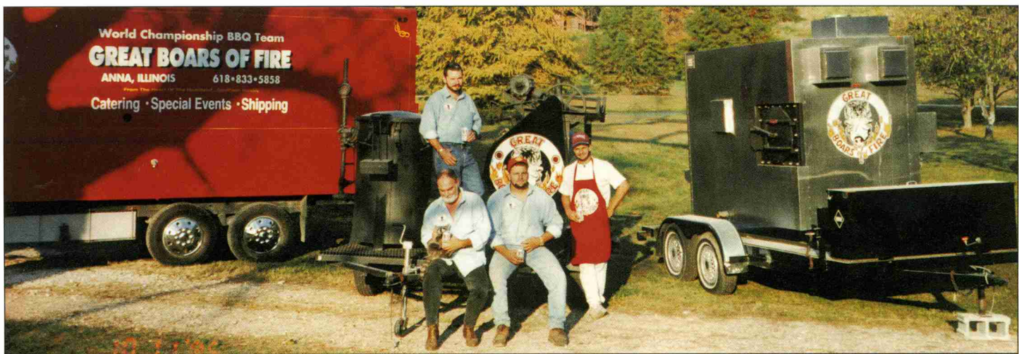
Great Boars of Fire barbecue catering service has found the recipe for success with Southern Pride's portable smokers.